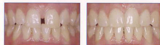
Generalized Spacing Treatment: 9 months, 19 aligners