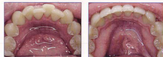
Crowding Treatment: 7 months, 14 aligners *Treatment time and number of aligners will vary from case to case.